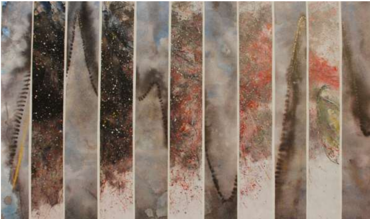
Original of the collage Sono-e awarded at the Annual Juried Exhibition –Third Virtual Show 2011

Ming Chiao Chapter will host the Annual National Sumi-e Exhibition 2012 in Minneapolis, MN, USA.